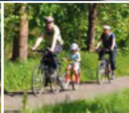
Radweg Sieg cycling path