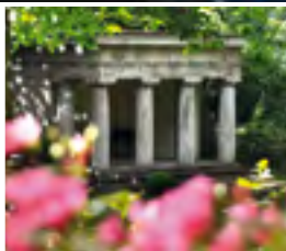
Merten Castle grounds