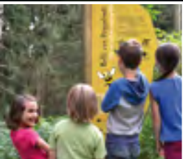
Educational bee trail