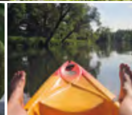
Canoeing on the Sieg