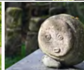
Vetere sculpture garden