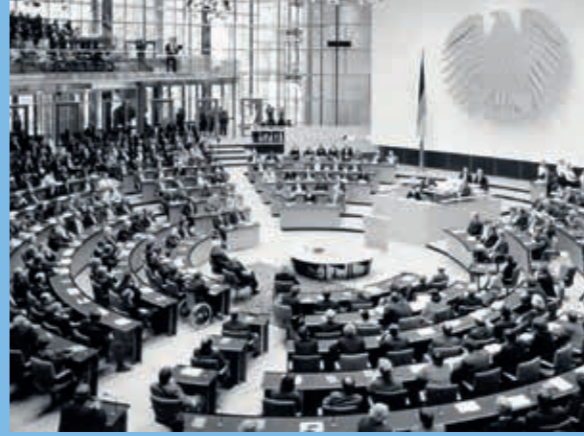
▲ First session of the German Bundestag in the new plenary chamber in 1992