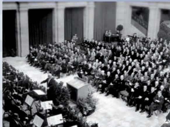
▼ Ceremonial opening of the Parliamentary Council in the Museum Koenig in 1948