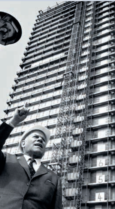
▲ Bundestag President Eugen Gerstenmaier at the topping-out ceremony of the "Tall Eugen" in 1968