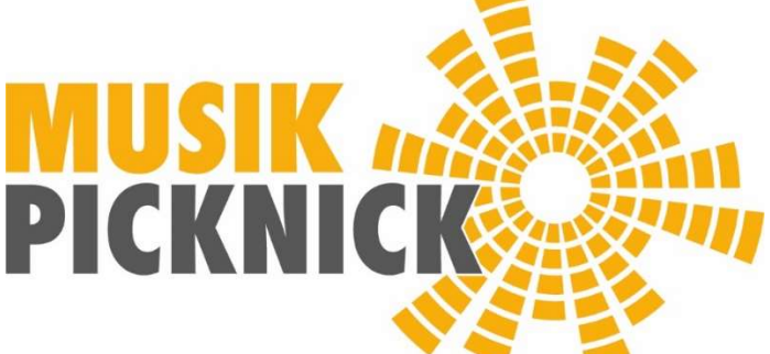
BTHVN Music Picnics – A Triad